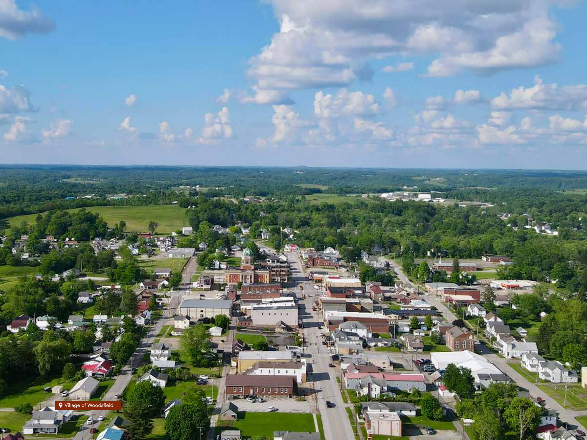
📍 Village of Woodsfield