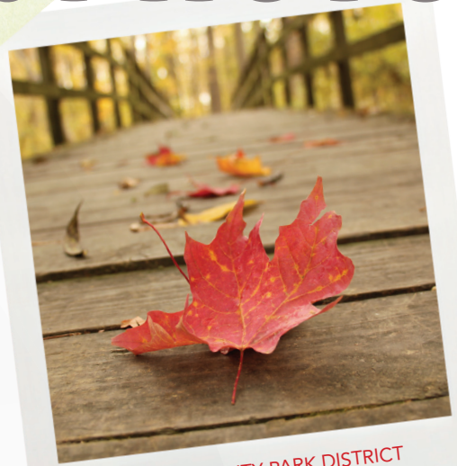
WOOD COUNTY PARK DISTRICT

For more information regarding Submission Guidelines, please see next page.