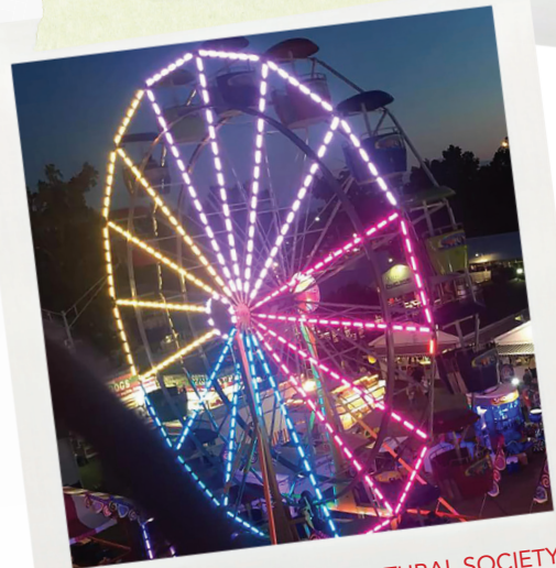
FULTON COUNTY AGRICULTURAL SOCIETY