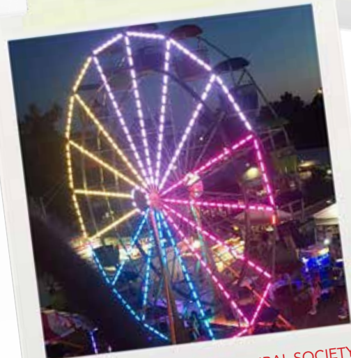
FULTON COUNTY AGRICULTURAL SOCIETY